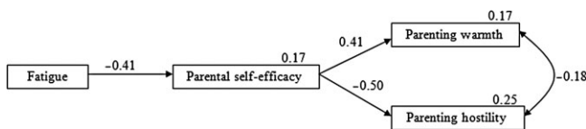
Figure 2. Mediating model of the relationship between fatigue, parental self-efficacy and parenting warmth and hostility. Note. All model pathways are significant at P < 0.001 ; residual error terms between parenting warmth and hostility correlate.

Satorra–Bentler chi-square (Muthén & Muthén, 1998–2012). Model fit was assessed using the chi-square test ( \chi^2 ), and other practical fit indices including the Tucker–Lewis index (TLI), the comparative fit index (CFI) and root mean square error of approximation (RMSEA). Indices for the TLI and CFI should exceed 0.90 for an acceptable fit, and values for the RMSEA are acceptable when close to or below 0.05 (Hu & Bentler 1999).