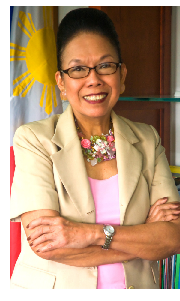
Patricia B. Licuanan, Chairperson of the Commission on Higher Education (CHED)

Licuanan recalled the international instruments such as the World Declaration on Education for All (1990), the Beijing Platform for Action (1995) and the Millennium Development Goals or MDGs (2000-2015) in support of gender equality in education for women and girls.