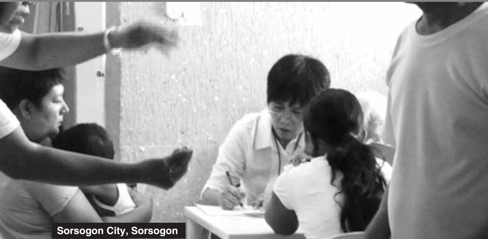
Sorsogon City, Sorsogon