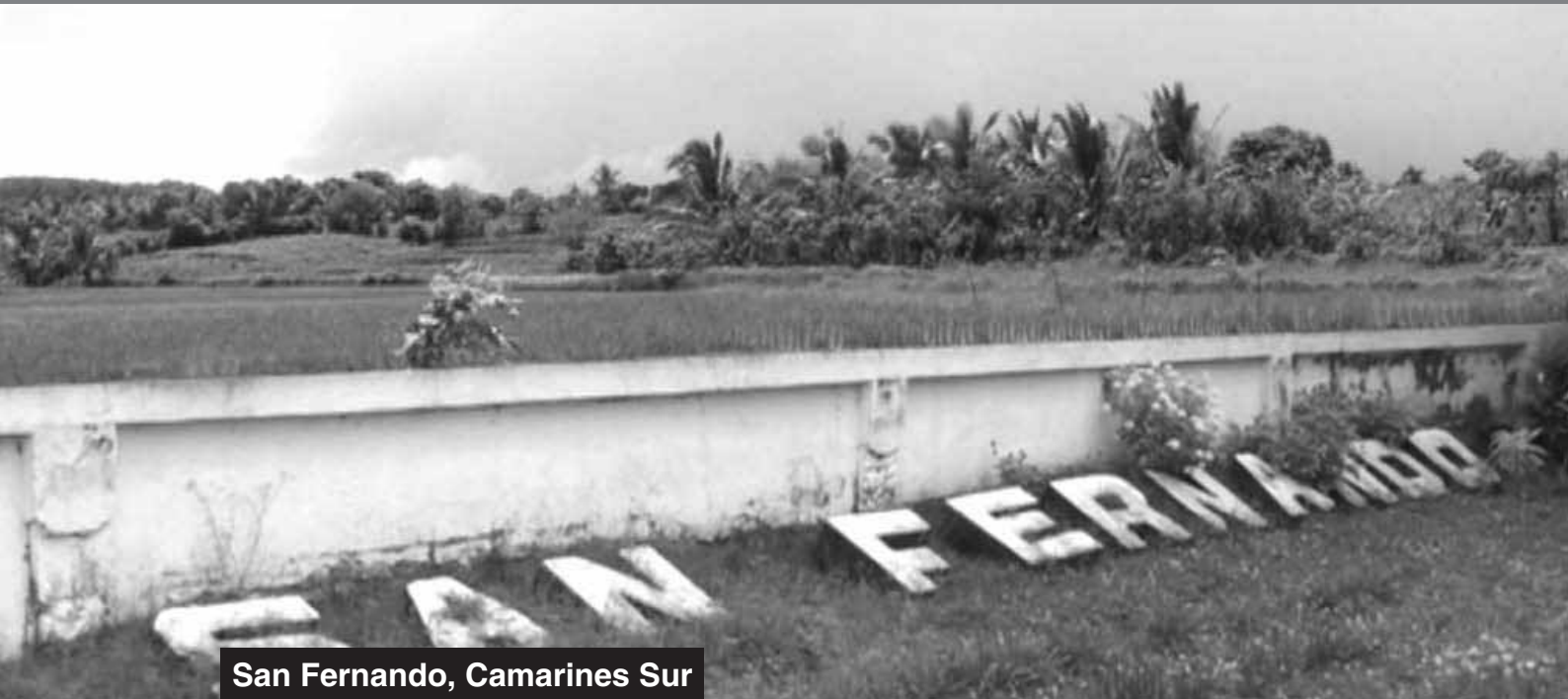
San Fernando, Camarines Sur