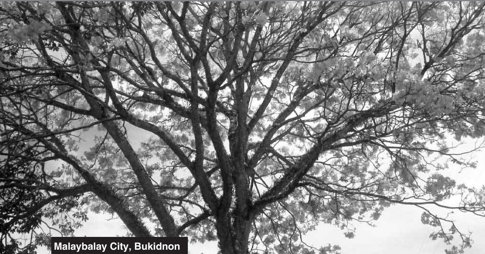
Malaybalay City, Bukidnon