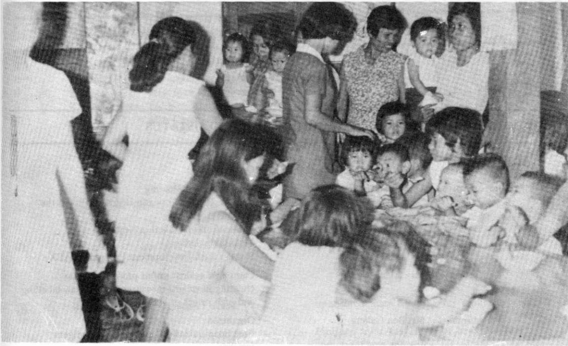
South Cotabato Balikatan sponsored Feeding Center in Tampakan.