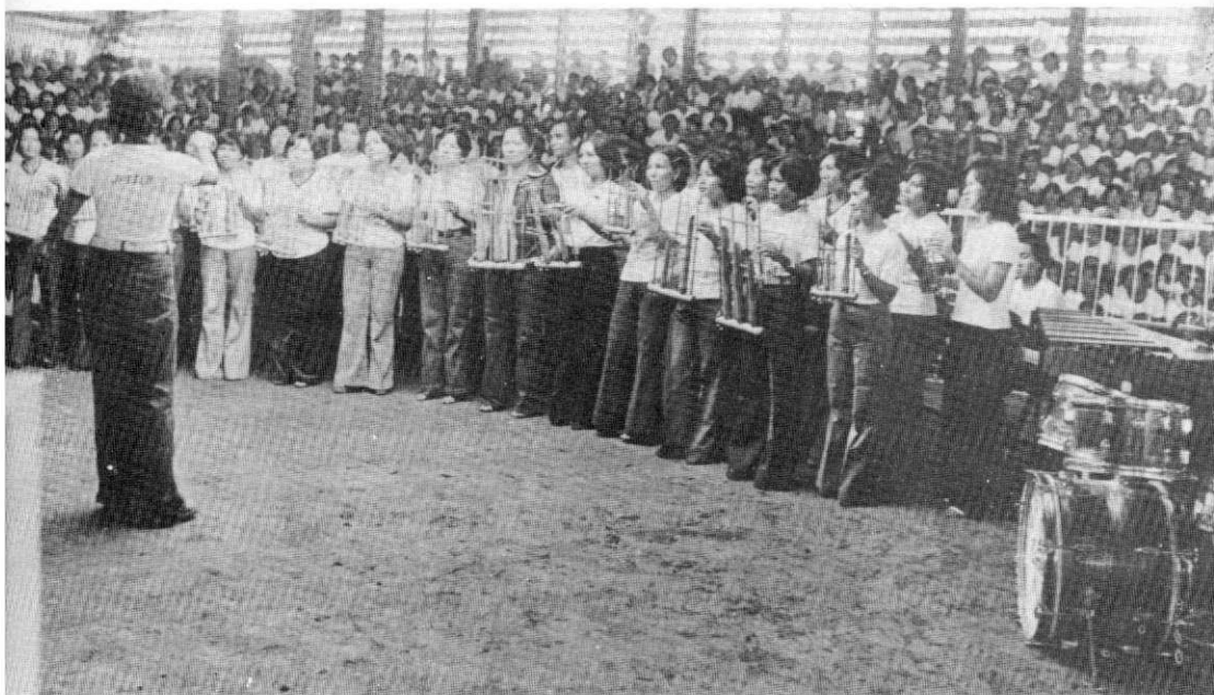
Rural women perform an "Angklung Number" for their guests.