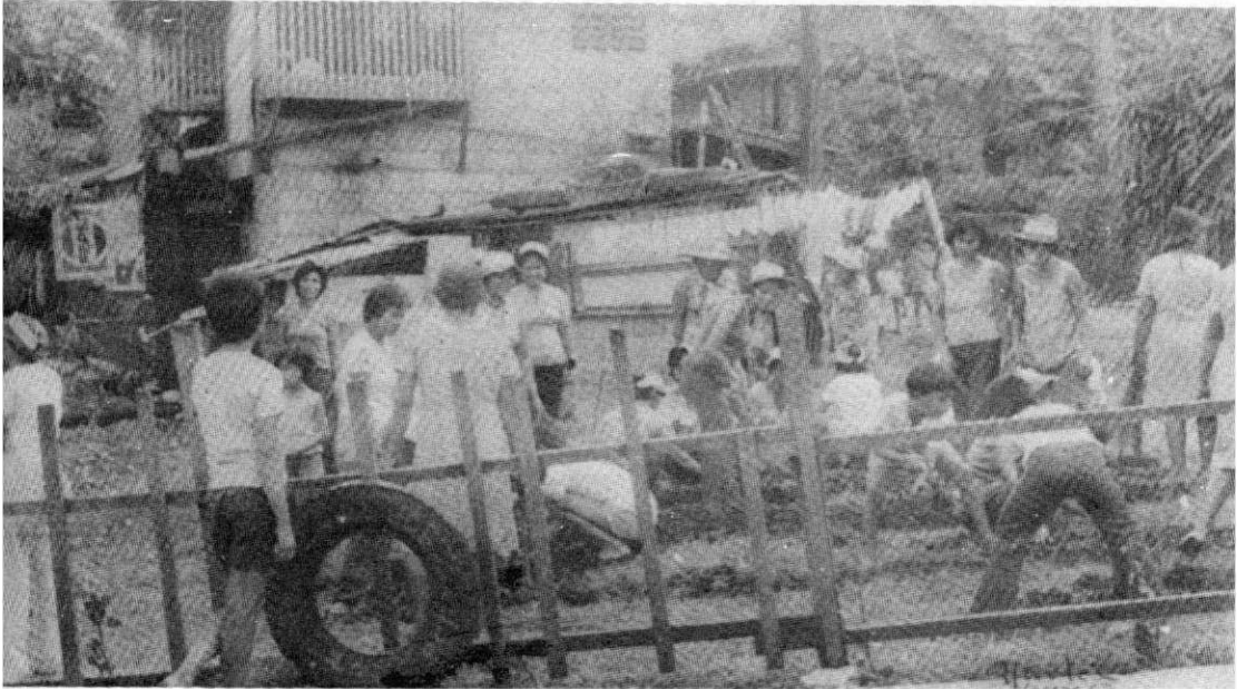
Tree Planting Project sponsored by Lucena City Balikatan Chapter – Sept. 11, 1978.