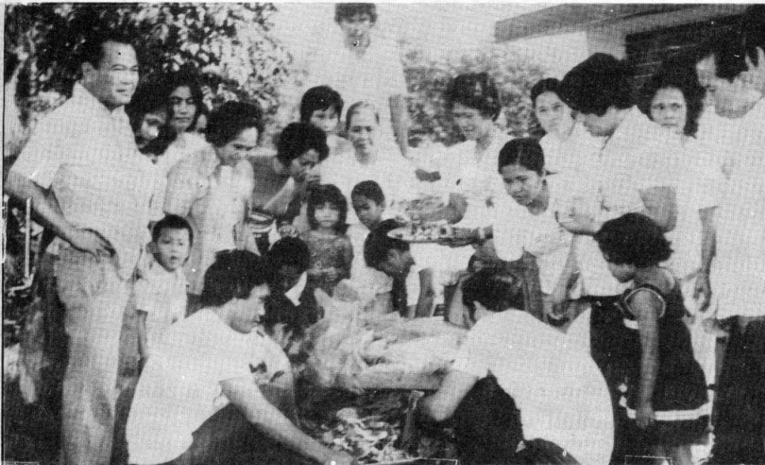
South Cotabato Balikatan sponsored Mushroom Production.