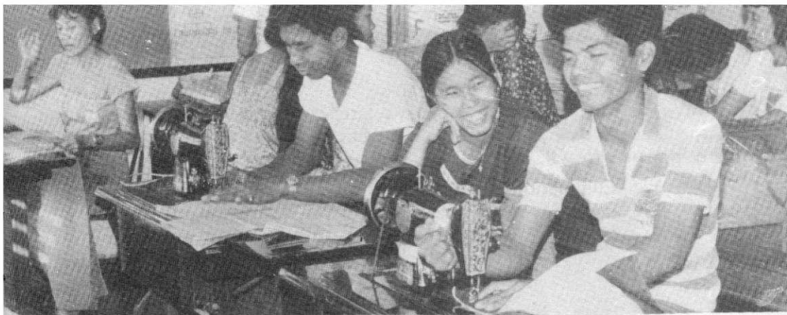
TAILORING CLASS – A joint project of the MSSD, Olongapo and Balikatan Olongapo City.