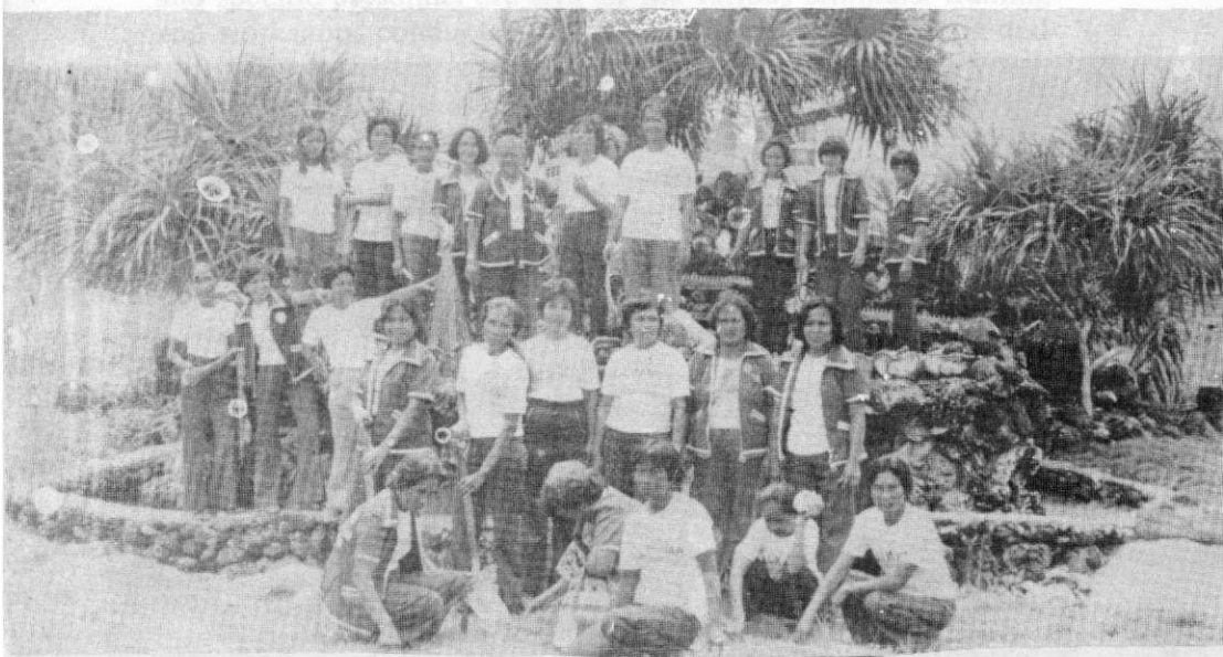
Cleanliness and Beautification Drive – Sta. Teresita Cagayan.