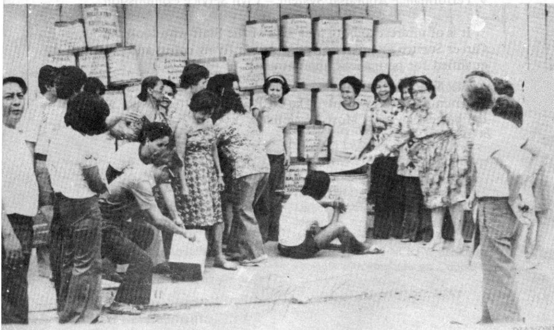
OPERATION CLEANLINESS – Painting of Balikatan Trash Cans sponsored by Lucena City Balikatan Chapter.