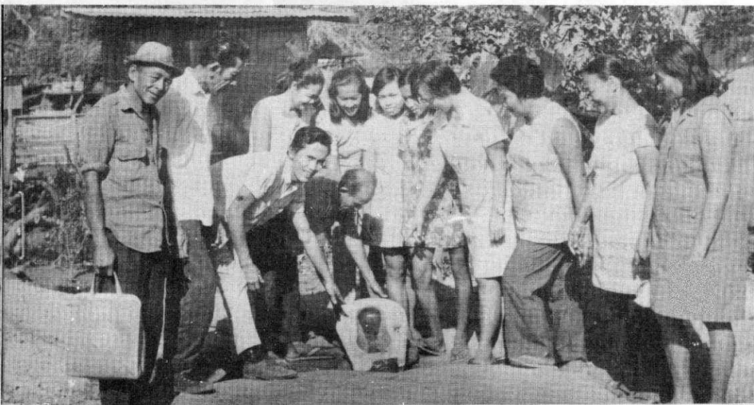
Distribution of water sealed bowls to depressed families in Barangay Silway, Polomolok, South Cotabato.